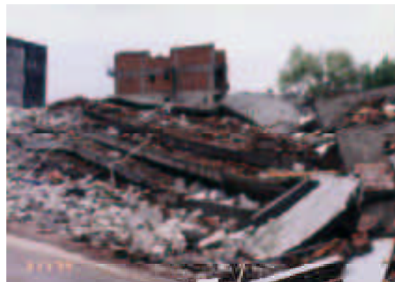
Figure 2: Totally Collapsed Building from Turkey Earthquake