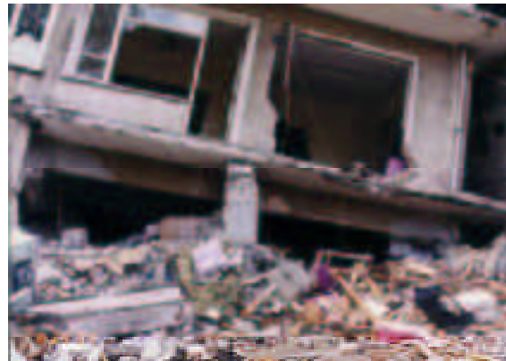
Figure 1: Partially Collapsed Building from Turkey Earthquake

In the following sections, we will briefly discuss how USAR missions tax specific components of an intelligent system.